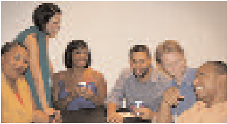
The cast of As Much As You Can

campaign was launched in order to bring the property up to current building codes and ADA standards. Lead grants from Las Patronas and The Parker Foundation led the early fundraising, and hundreds of patrons pitched in during the fall "Give Us A Lift" campaign. An anonymous challenge grant of $25,000 was received in the late fall and fundraising for this project continues. Construction is underway and a new Lift should be installed by the end of January. More that $157,000 has been given or pledged for the project as of mid-