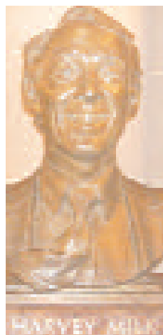
The bronze bust of Harvey Milk in San Francisco's City Hall

The James Irvine Foundation New Connections Fund continues to play an important role in helping develop new work at Diversionary, funding in part the creation of The Daddy Machine and our