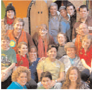
It takes a family of creative artists to stage a world premiere musical